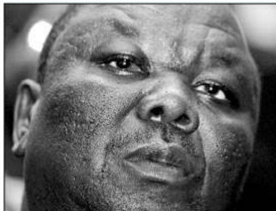
Opponent: Opposition leader Morgan Tsvangirai