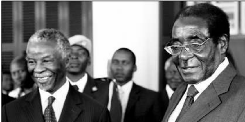
Ally: Robert Mugabe, right, with South African President Thabo Mbeki